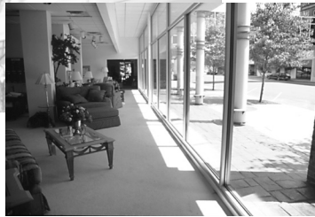
Good's Central Historic Arcade