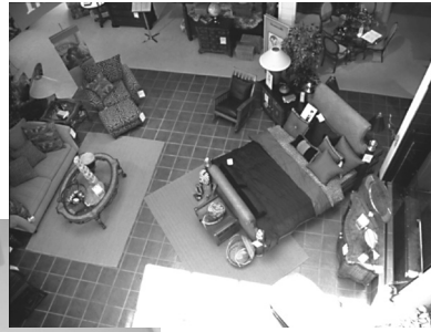
Good's Central Atrium & Glass Elevator