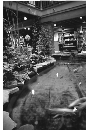
Market Square Gift Emporium