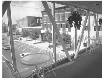
Airy Skywalk over Main Street USA