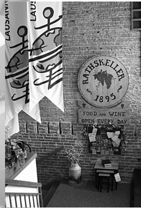
Wine Cellar Entrance